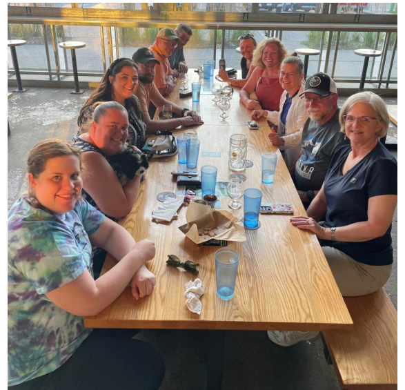
Theology on Tap @ Singlespeed in Waterloo