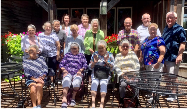
Joyful Times Trip to the Amana Colonies