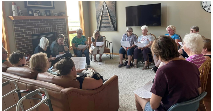
Wine, Women, and the Word Bible Study