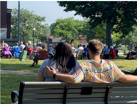
Community Worship at the Park