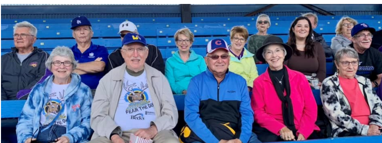
Joyful Times at the Waterloo Bucks game!