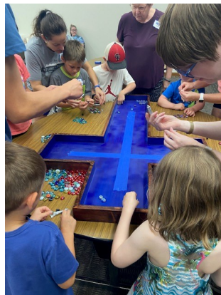
Learning, Serving, and Growing at Vacation Bible School- F5 Refresh!